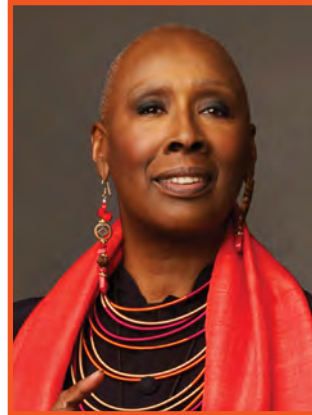
JUDITH JAMISON ARTISTIC DIRECTOR EMERITA